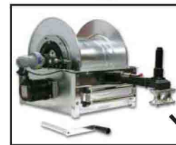
Inset: Nordic™ Series 3900 LPG with optional Hose Boss™