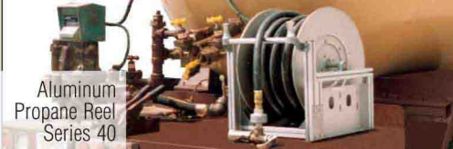
Aluminum Propane Reel Series 40