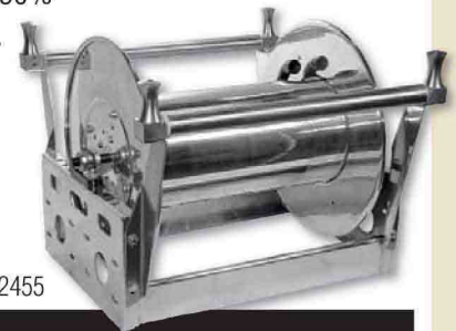
Nordic Series 2455

The aluminum Series 2400 reel for booster hose is corrosion-resistant and weighs up to 50% less than standard steel booster reels. Features include an aluminum spool and frame assembly, plated steel fluid path and plated sprocket and fasteners. No painting or finishing is required.