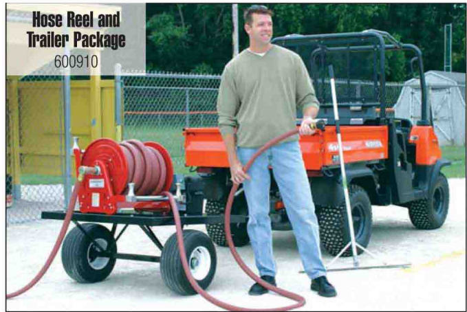
Hose Reel and Trailer Package 600910