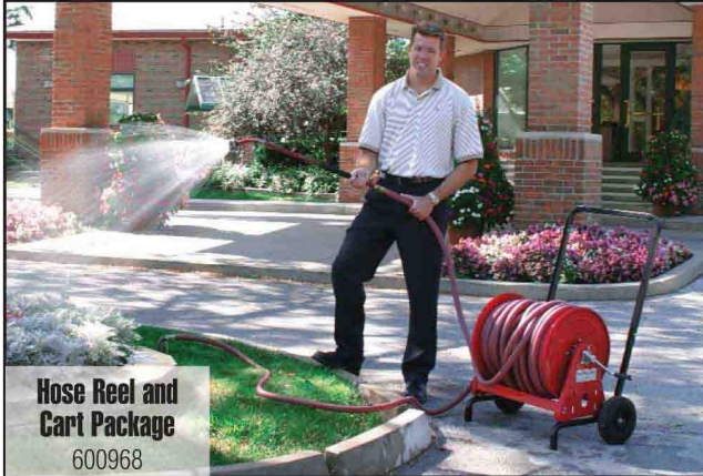
Hose Reel and Cart Package 600968