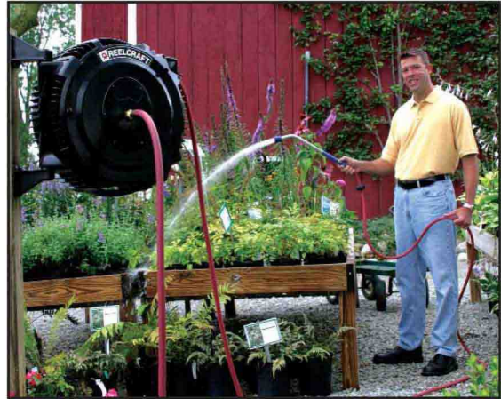
Arbor Farms Nursery, Fort Wayne, Indiana

Pound for pound the S Series offers distinct weight advantages due to the composite case construction.