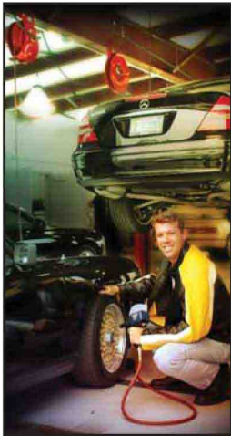
Fry's Napa AutoCare Center, Columbia City, IN