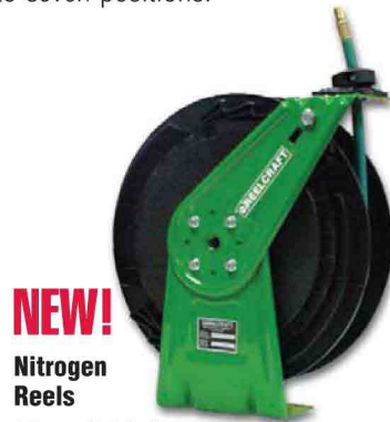
NEW! Nitrogen Reels RT650-OLPG-GN205