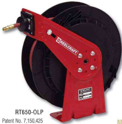
RT650-OLP Patent No. 7,150,425