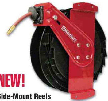
NEW! Side-Mount Reels RT650-OLPSM