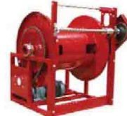
Fiber optic cable