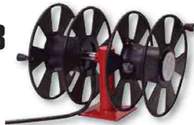
Series CEA 30000