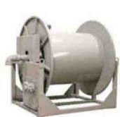
Marine grade epoxy